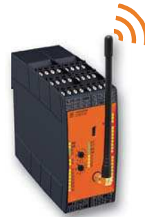
Radio controlled safety module UH 6900